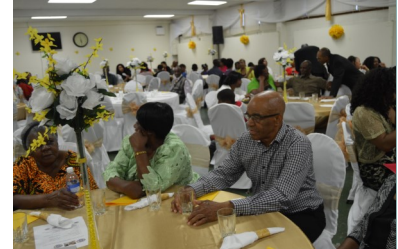
100th Birthday Party